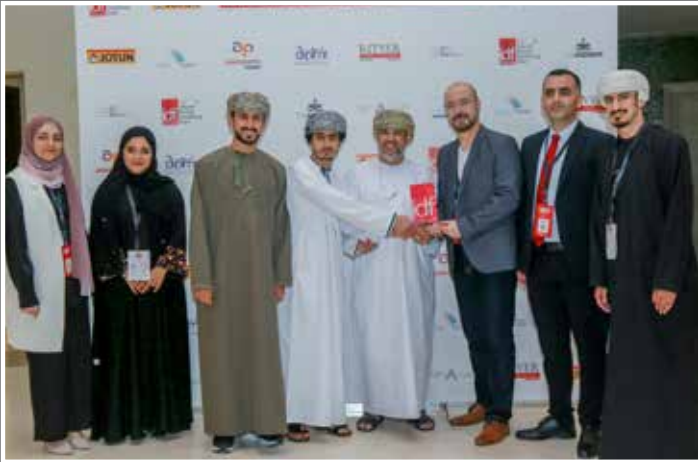
ARINA HOME [GLOBAL FURNITURE SPC]