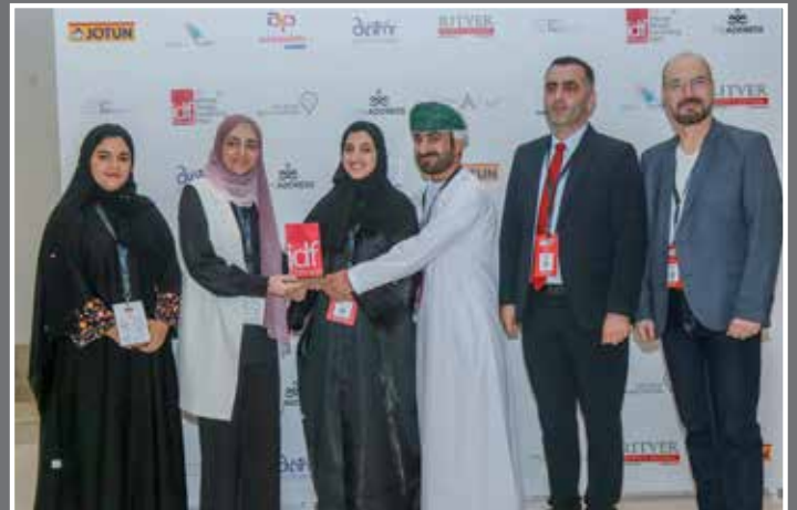
SORA DESIGN STUDIO