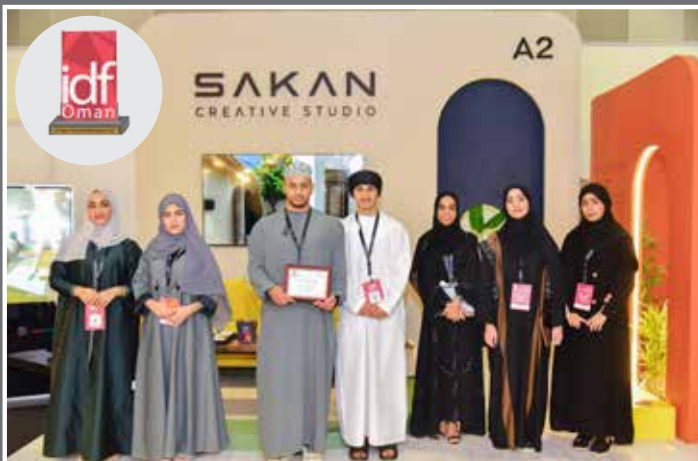
SAKAN CREATIVE STUDIO