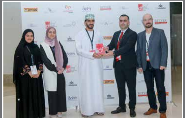
ENGINEER ARCHITECTURE - INTERIOR DESIGN