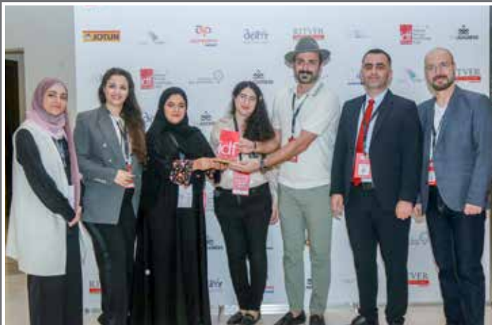
MUNEEB AHMED SULAIMAN TRADING