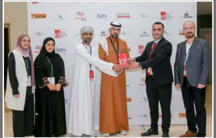
THE ADDRESS GROUP